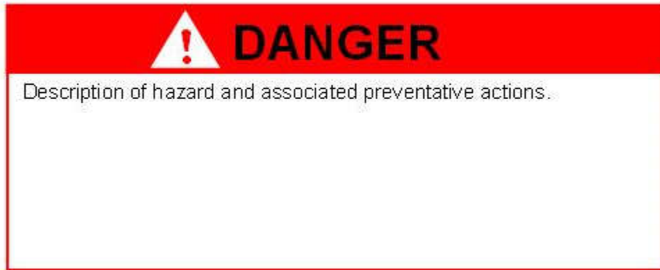
Figure 1: Sample Danger Notice